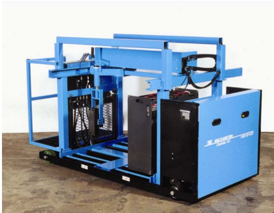
MST1-53 DC Powered Unit