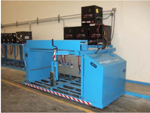
MS4-14 DC Powered Unit (Standard A1 Vehicle & Yoke Shown)