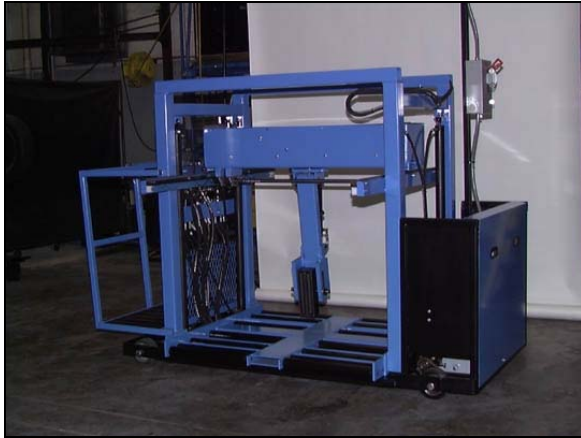
MSTAC1-53 AC Powered Unit (Shown with Special Bridge Assembly)